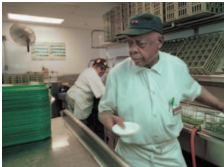
Dining-hall workers have much at stake in the committee's recommendations.

play a role, though thankfully less than they used to. Considerations of whether higher pay induces workers to provide more effort, especially in relation to norms of fairness, play a role. Government regulation plays a role. And plain old luck plays a role.