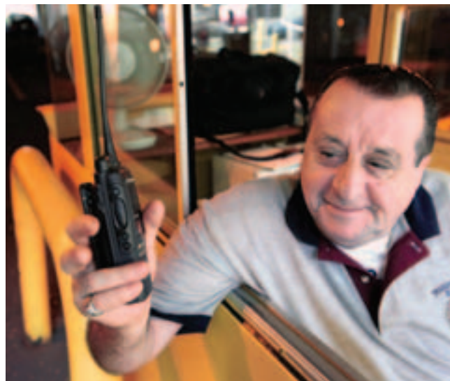
Transportation Services staff members handle parking, passenger shuttles, and mail delivery.