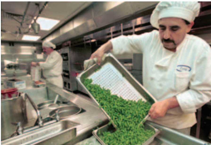
Dining Services workers prepare tens of thousands of campus meals weekly.

clear that the student sit-in struck a chord on the campus and nationwide. In some fashion or other, the University will pay more to its lowest-paid staff members and find a way to include those working for subcontractors in the higher wage—even though market forces allow for lower pay.