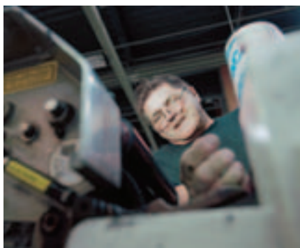
A mechanic maintains office equipment.

It is founded rather in the understanding that the central goals of teaching and research can include all who serve them, however indirectly. The rarity and usefulness—even the nobility—of these goals lend a certain kind of dignity and purpose to the many activities that make them possible. This understanding can be represented in different ways, some material