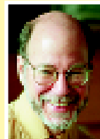
H. Robert Horvitz

No current faculty members won a Nobel Prize this year, but several of the new laureates do have a Harvard connection. For his work on genes responsible for regulating natural cell death, MIT biology professor H. Robert Horvitz, Ph.D. '74, shared the prize in physiology or medicine. Vernon L. Smith, Ph.D. '55, co-winner in economics, was rec-