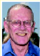
Vernon L. Smith

recognized for applying experimental techniques to the field. Formerly a professor at Purdue and the Universities of Massachusetts and Arizona, he is now professor of economics and law at George Mason University. Riccardo Giacconi shared the prize in physics with two other researchers. He was recognized for pioneering X-ray astronomy; part of that work was conducted during Giacconi's stint as professor of astronomy, from 1973 to 1981. Today he presides over Associated Universities Inc., the Washington, D.C.-based consortium that runs the National Radio Astronomy Observatory.