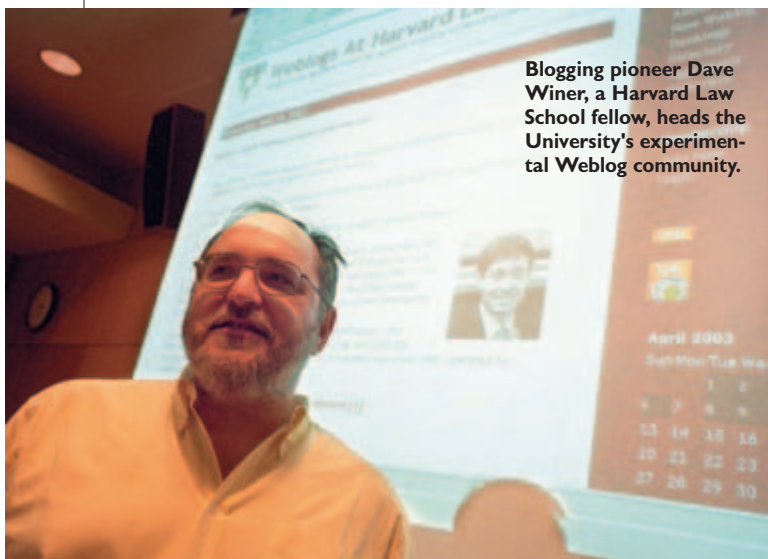
Blogging pioneer Dave Winer, a Harvard Law School fellow, heads the University's experimental Weblog community.

audio interviews with leading bloggers, including some of those managing the on-line presidential campaigns.